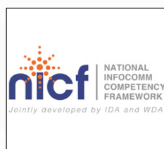
National Infocomm Competency Framework (NICF)