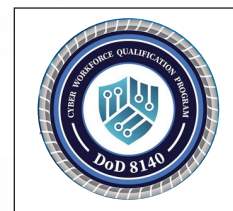
Cyber Workforce Qualification Program