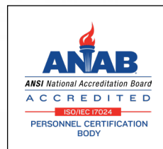
ANSI National Accreditation Board (ANAB)